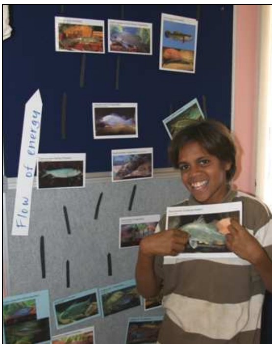
Kulkarriya School member

Looma, Jarlmadangah and the school, Ngurtuwarda, Noonkanbah and the Kulkarriya School, Bayulu, Muludja, and Fitzroy Crossing. We also met with Executive members and staff at Karrayili, KALACC and Marra Worra Worra.