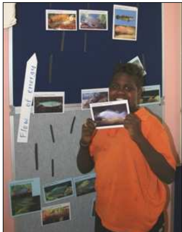
Kulkarriya School member