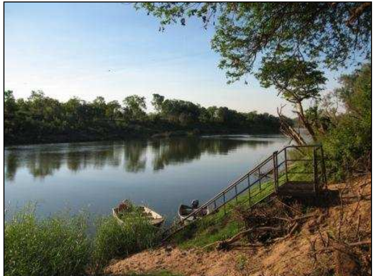
Daly River at Nauiyu