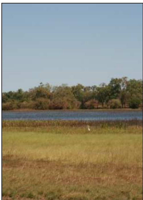
Red Lily Billabong