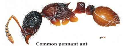
Common pennant ant Tetramorium striolatum