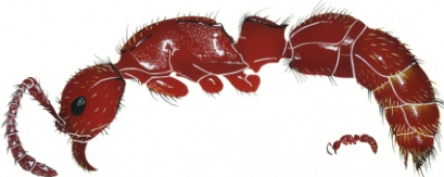
Angle-headed cannibal ant Cerapachys singularis