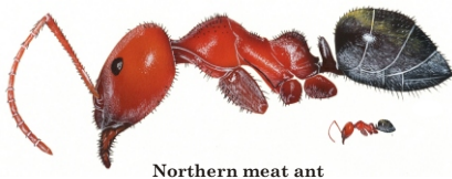
Northern meat ant Iridomyrmex sanguineus