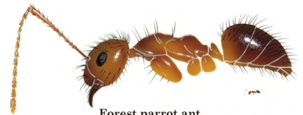
Forest parrot ant Paratrichina vaga