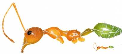
Green tree ant Oecophylla smaragdina