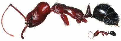
Giant snappy ant Odontomachus turneri