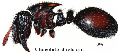
Chocolate shield ant Meranoplus nijobergi