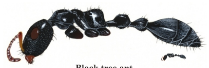
Black tree ant Tetraoponera punctulata