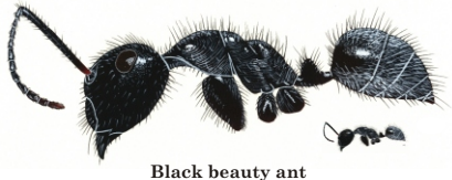
Black beauty ant Calomyrmex impavidus