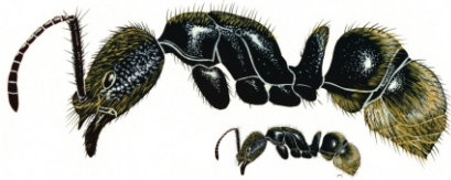
Giant foaming ant Bothroponera hera

Approximately 1500 species of ants occur in the monsoonal zone of northern Australia. Here are some of the common species.