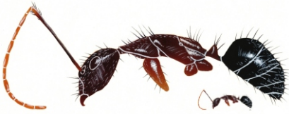
Northern common sugar ant Camponotus novaehollandiae