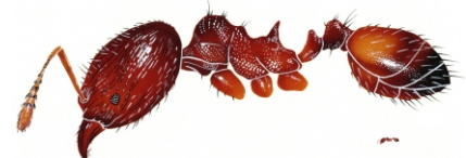
Native big-headed ant Pheidole sp. (major)