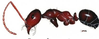
Common furnace ant Melophorus fieldi