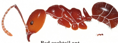
Red cocktail ant Papyrius nitidus