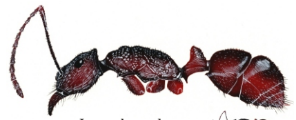
Lesser-horned pony ant Rhytidoponera aurata