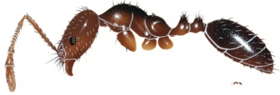
Little black mono ant Monomorium nigrius