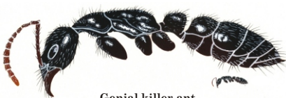
Genial killer ant Leptogenys exigua