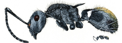
Savanna spiny ant Polyrhachis senilis