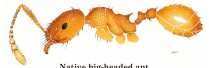
Native big-headed ant Pheidole sp. (minor)